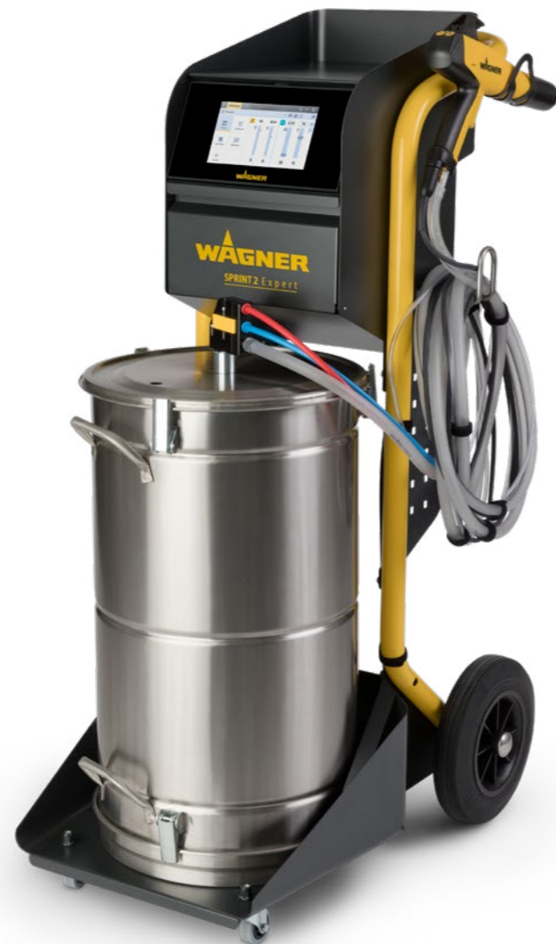
Sprint 2 Expert HW