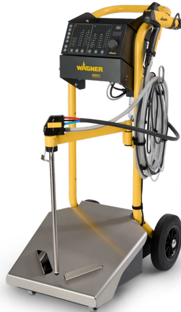
Sprint 2 B