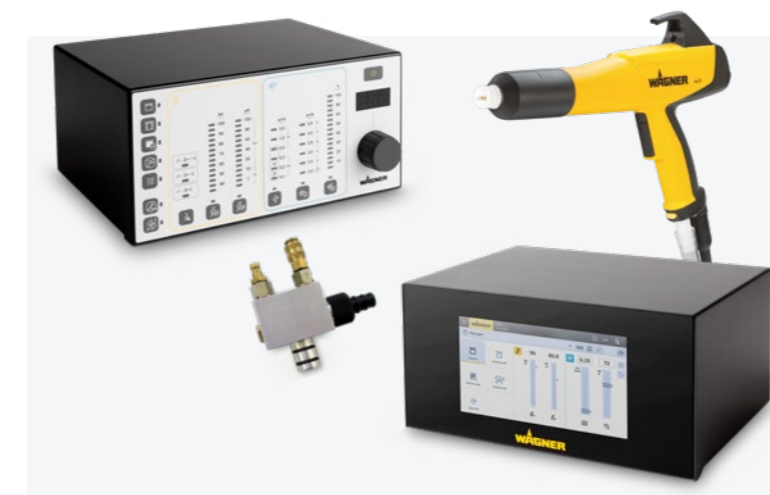
Sprint 2 MPS, Sprint 2 Expert MPS

The manual powder set consists of the core components for setting up a manual coating system or as a pre-/post-coating workstation in an automatic system: Manual gun PEM-X1, control unit (WACON Sprint 2 Expert / WACON Sprint 2 X), PI-F1 injector and powder hose set.