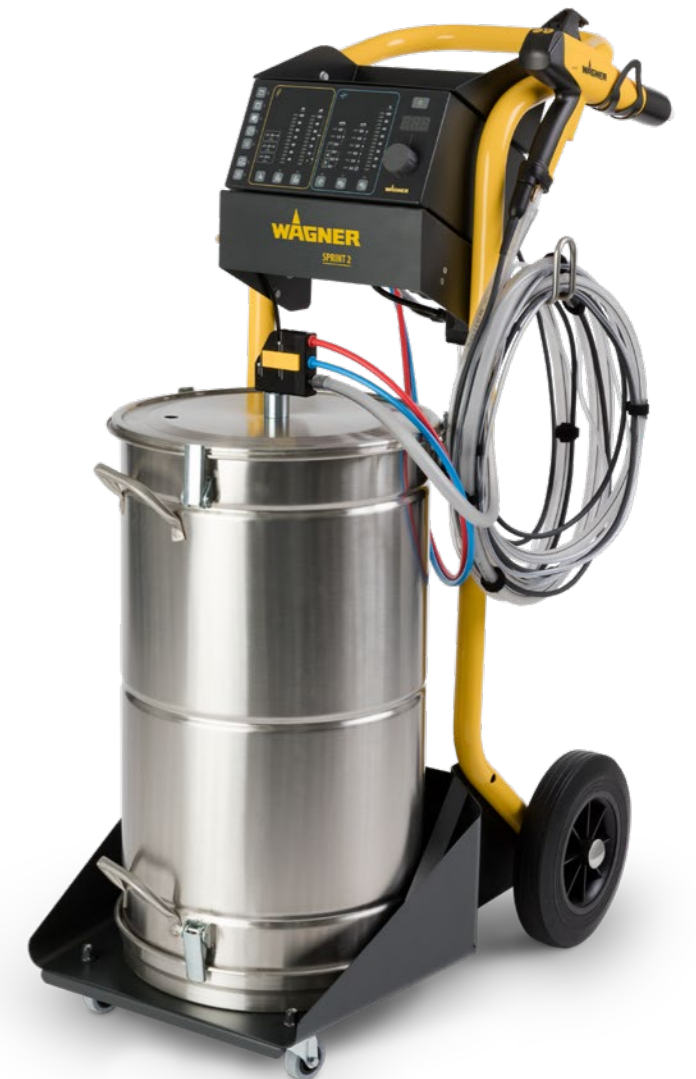
Sprint 2 H