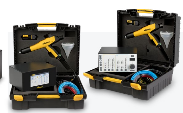
Sprint 2 Expert CG

The mobile case set is suitable for individual parts and small quantities, as well as for laboratory and development purposes. It is easy to set up anywhere and can be operated directly from the case. The PEM-X1 CG cup gun impresses with its simple cup change concept for super-fast color changes.