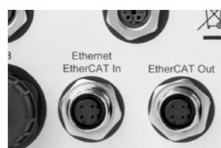
Right: Optionally with EtherCAT interface