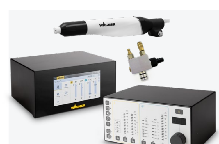
Sprint 2 APS, Sprint 2 Expert APS

The automatic powder set consists of the core components for integration into individual automatic solutions in system engineering and is available in different versions: PEA-X1 automatic gun, control unit (WACON Sprint 2 Expert / WACON Sprint 2 X), PI-F1 injector and gun cable.