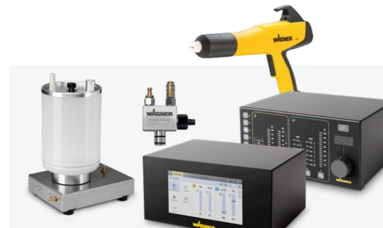
Sprint 2 T Sprint 2 Expert T

In addition to the control unit and manual gun, the table set includes a compact vibrating table with a 3-liter fluid hopper attachment, Hi-Coat injector and 9 mm powder hose. Extremely fine coatings are achieved with this setup - e.g. in laboratory environments, for special applications such as the non-destructive testing of cast parts or for small parts with very high surface quality requirements (e.g. wheel finishing).