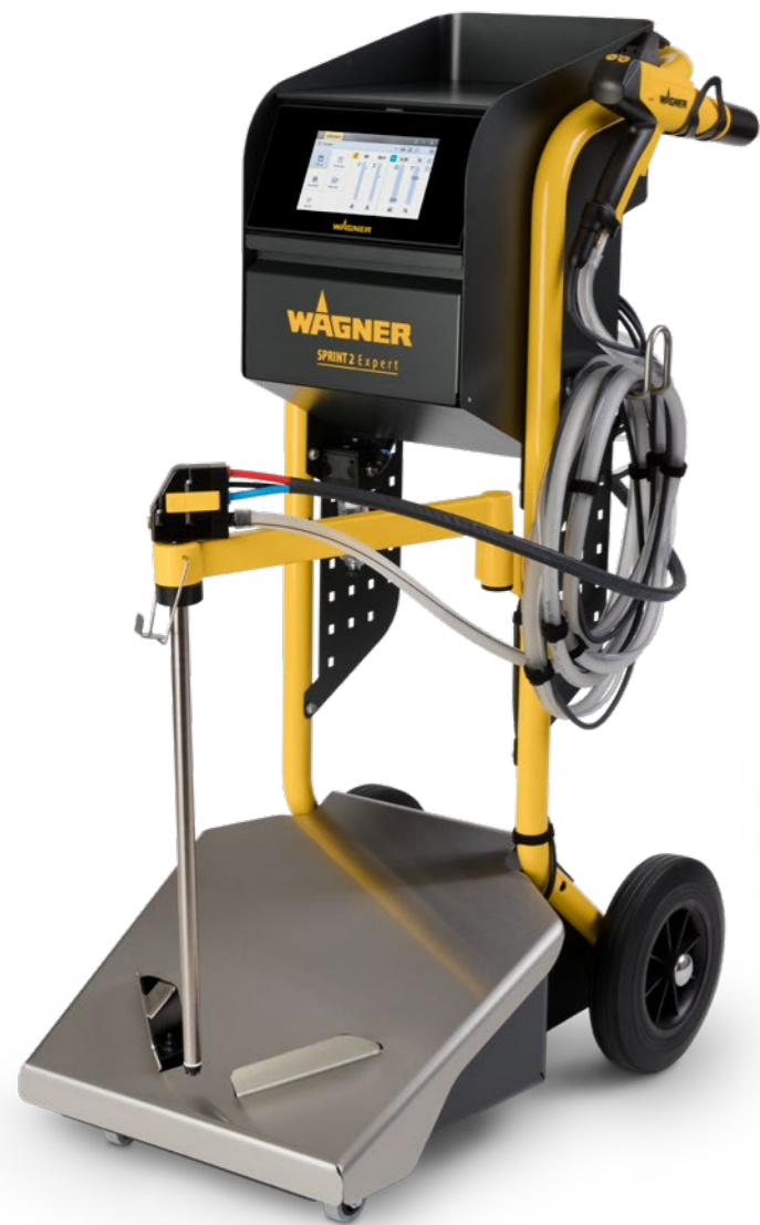
Sprint 2 Expert BW