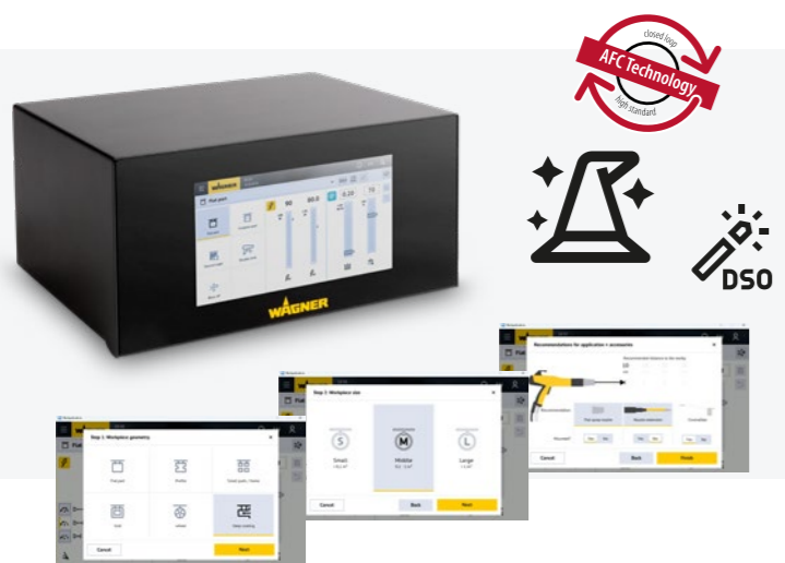
WACON Sprint 2 Expert: Simple menu navigation with WAGNER Wizard